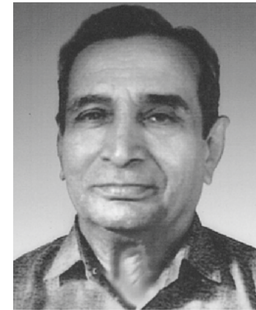
Hon'ble Late Shri Gyanchandji Raisoni

With the passing of everyday, modern life is creating the problems faster than it can solve them. In fact, the problems we face are assuming gigantic proportions. There seems to be no light at the end of the tunnel. Education & education alone is the remedy. But it has to be right type of education which is not identical merely with information. Education must operate in a symbiotic relationship with other sectors and this would eventually enrich our human resources with leaps and bounds. Bearing this in mind, let us strive utmost to give the younger generation lofty ideals & sense of oneness, to enable us to build modern India. Such an India would be boon for the modern world.